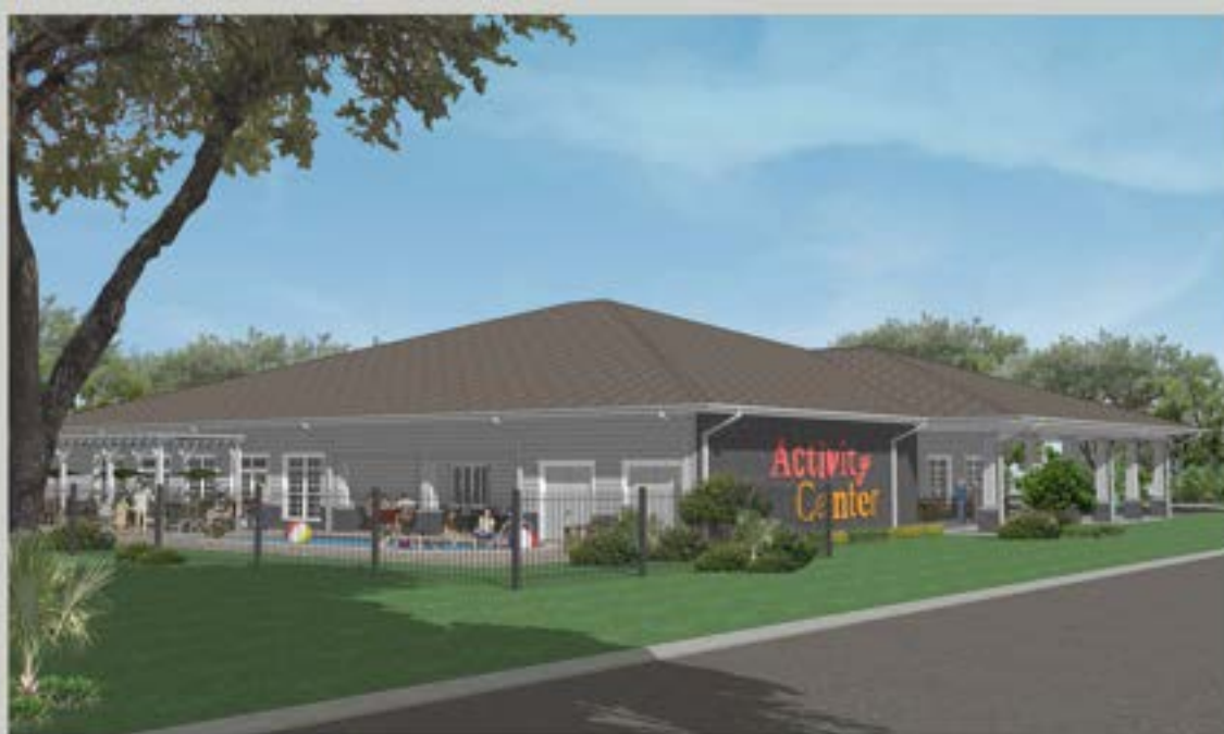
A Kid's Place - Activity Center

For the first time on campus, our children, House Parents, and staff will be able to come together inside for events like birthdays, graduations, awards banquets, Halloween trunk-or-treats, and Thanksgiving dinners. Such events restore a sense of normalcy in children's lives and strengthen our community from the inside out.